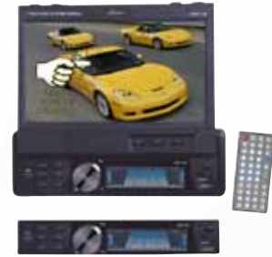
FULL DETACHABLE FRONT PANEL